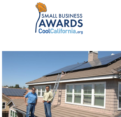
For every installation, Clean Solar donates to a charity in the name of the customer.

As a solar installer in both the residential and commercial sectors, it is in Clean Solar's nature to lower energy costs by reducing greenhouse gas (GHG) emissions. However, as they have lowered clients' GHG emissions, they have also taken significant actions to reduce their own. At Clean Solar, they purchase recycled printer paper, toilet paper, paper towels, office supplies, office furniture, and compostable catering supplies. They have a printer dedicated to recycled paper (utilizing both sides of a page before recycling it); they recycle toner cartridges; have designated bins for recycling paper, cardboard, plastic, glass, metal, and composting; and they use real dishes and utensils instead of throwing away or recycling paper or plastic items.