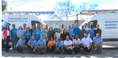
The staff of Clean Solar on a bright sunny day ready to install solar panels.

Powering Homes and Lowering Carbon Footprints